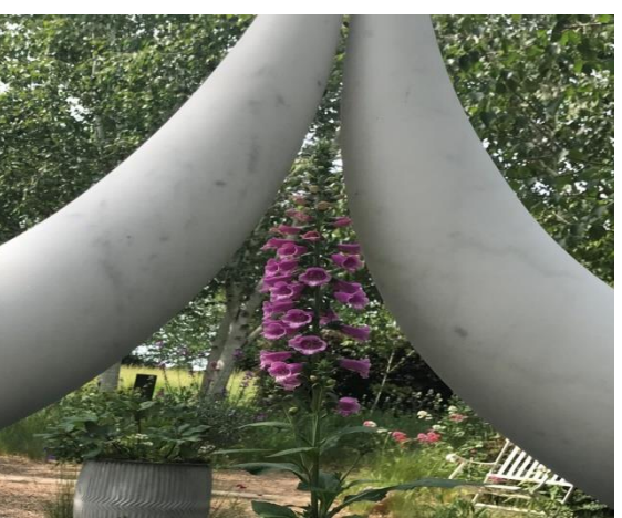
Each time we turned a corner, there was something new and exciting to discover.